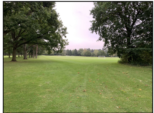
and multiple sports fields as well as hard tennis courts

The extensive school grounds contain numerous sports facilities which include an outdoor-heated swimming pool, an astroturf pitch, a golf course, hard tennis courts and several football pitches.