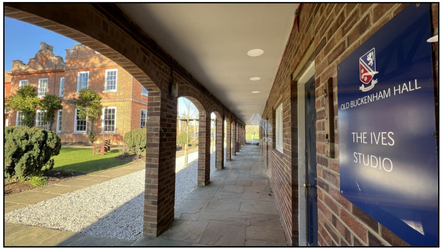
View across the lawn of the 400 year old Old Buckenham Hall, a former residence of Napoleon Bonaparte's brother.

Our junior residential course is held in the beautiful setting of Old Buckenham Hall School (OBH), near Ipswich and within easy access of London and the main London airports. The school lies within 90 spacious acres of stunning woodland with superb views across the Suffolk countryside and is in a secure location.