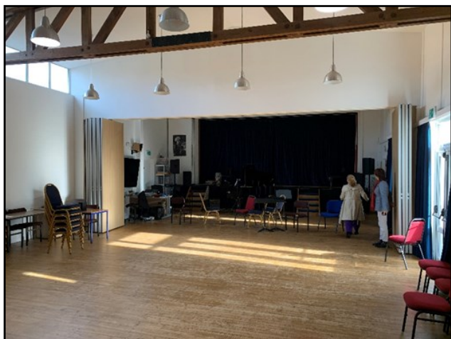
Morning Assembly, Music & Drama sessions take place in the school theatre.

OBH school has some excellent teaching facilities to support a wide-ranging curriculum. It boasts a suite of modern teaching classrooms with interactive whiteboards and a spacious theatre where we hold our morning assemblies and weekly student shows. There is an Art & Design Centre, Science block, IT Centre, Music School and outdoor classroom areas.