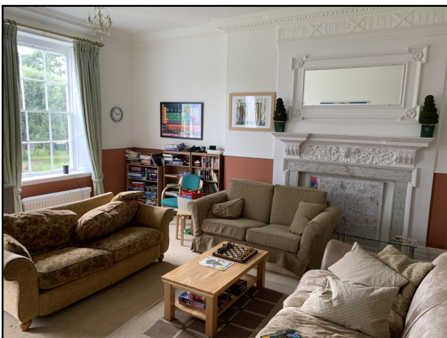
Quiet areas for students to relax before bedtime