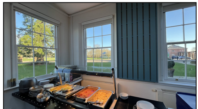
Students receive 3 meals per day in the school canteen . We cater for most dietary requirements.

Meals are eaten in the canteen, which is in the main part of the building. Students receive a choice of hot or cold food with a strong emphasis on healthy eating. We also have a weekly evening barbecue for students.