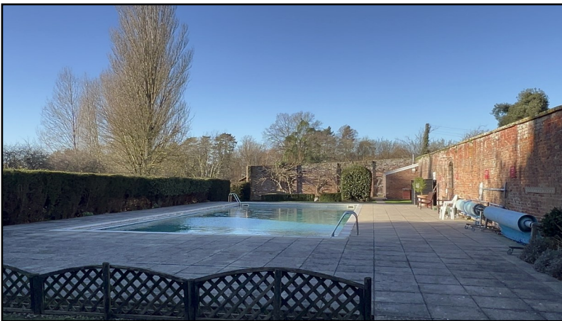
There is an outdoor-heated swimming pool

The facilities at Old Buckenham Hall School are excellent and help supplement on of our core values which is that learning should be student-centered and multi-faceted.