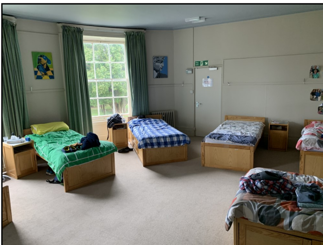
There are separate male and female dormitories