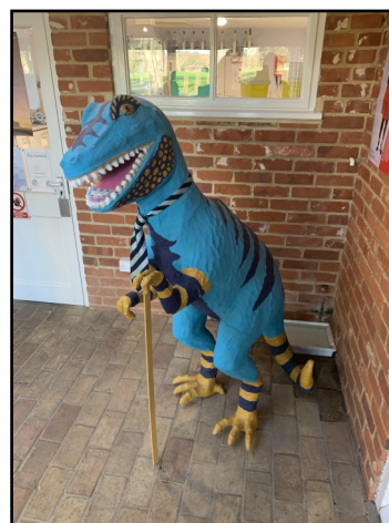
Students enjoy painting, drawing and sculpture in our well-resourced Art & Design Department