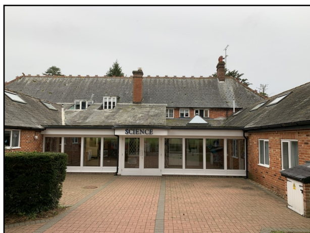
There are well-equipped science facilities