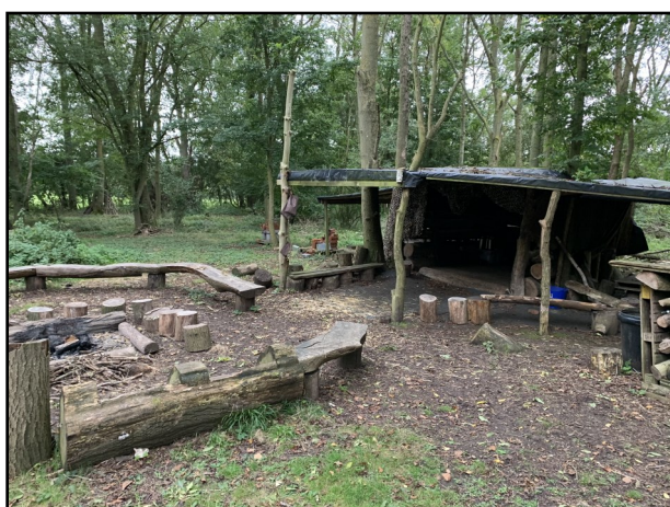
One of our outdoor classroom, which is popular amongst students