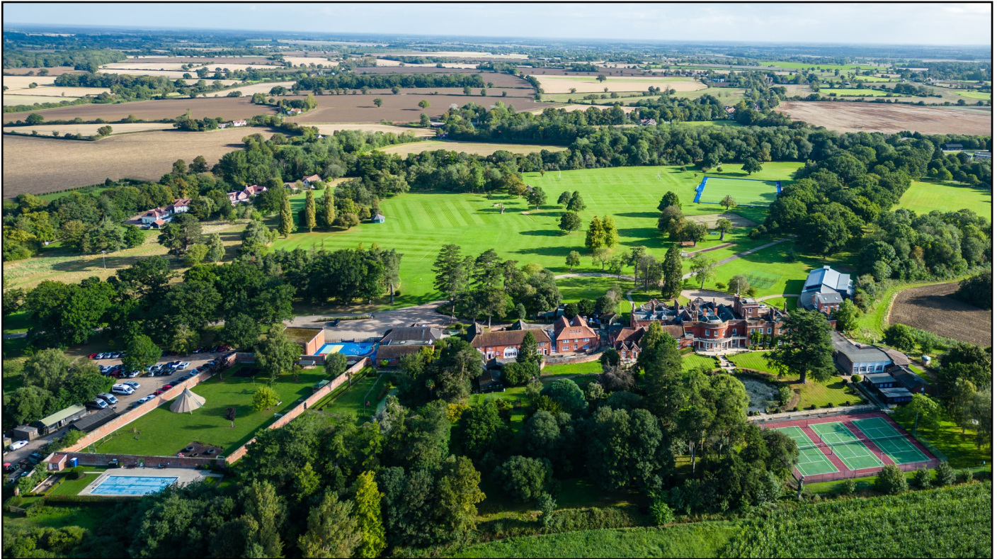
Students can learn and explore in a dynamic but safe environment immersed in nature.