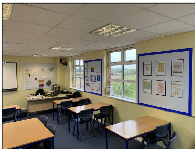
Classrooms are spacious with interactive whiteboards