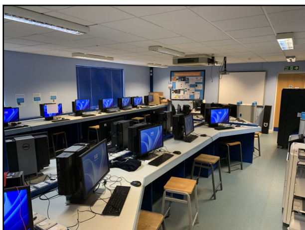
Students have regular use of the IT suite