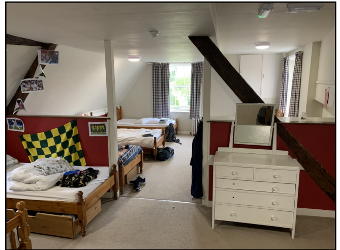
The sleeping areas are bright and spacious

There are also trained pastoral staff to deal with any individual concerns of the students.